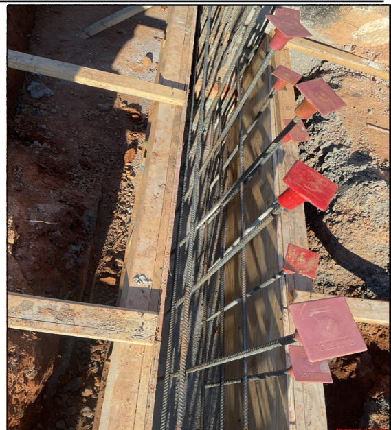
Poured wall for the New Kitchen addition