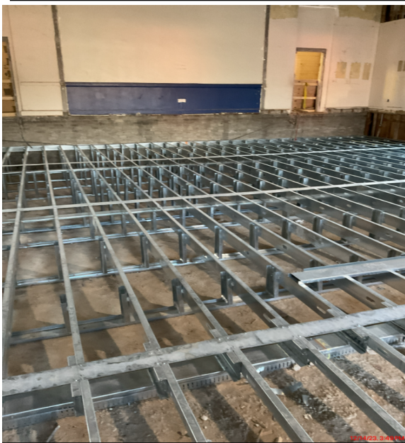
Media center metal stud deck framing is complete