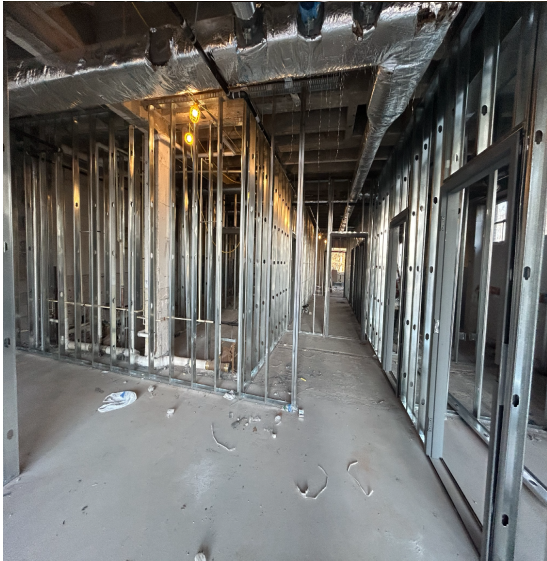
Continue metal stud framing in the 1928 wing