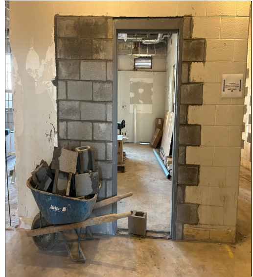
Continue door frame install on level 1